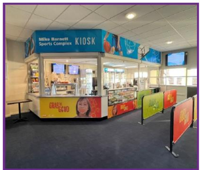
Image: MBSC display post implementation

The changes at MSBC have increased the availability and promotion of healthy food and drinks and decreased the availability and promotion of unhealthy food and drinks. This has resulted in greater access to healthier food and drink options for patrons, staff and visitors.