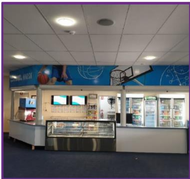
Image: MBSC display pre implementation

The Healthway funding was used to purchase five new café barriers and five decals displaying the Grab the Good message. A new menu board and product stickers have also been introduced, where food and drinks are colour coded to align with the traffic light system, indicating which options are green, amber or red.